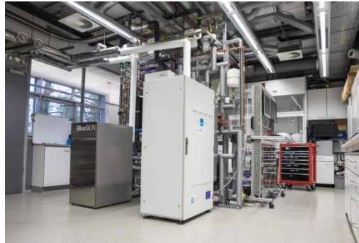
Test bench with CHP systems